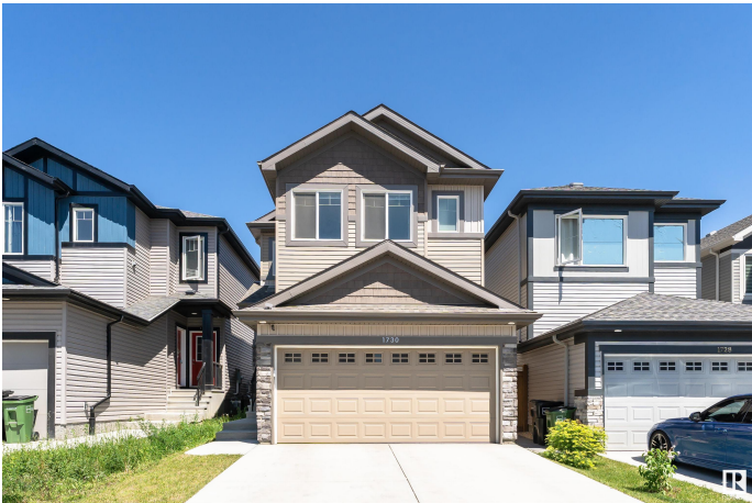
1730 Erker Way NW, Edmonton, AB

Main Floor Exterior Area 559.83 sq ft Interior Area 601.59 sq ft Excluded Area 393.83 sq ft